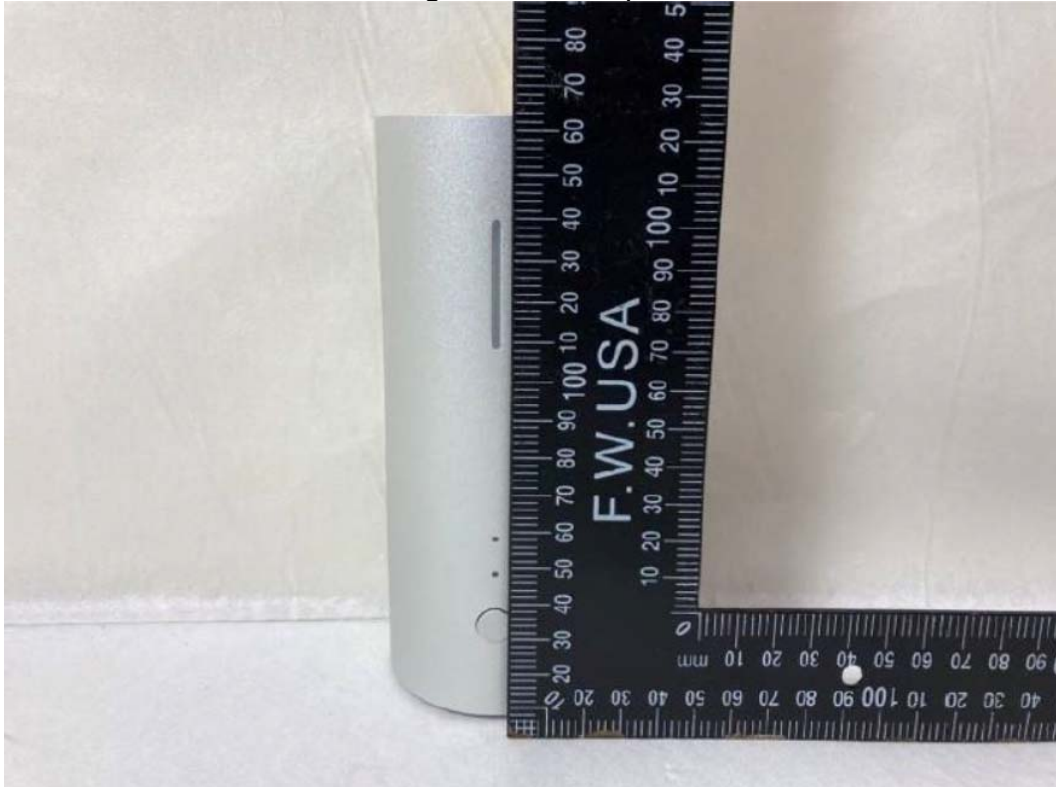
Located in the air stream 50 mm from the air outlet of the appliance